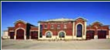
GILBERT FIRE STATION #1 Sundt Construction