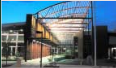
TEMPE MULTI-GENERATIONAL CENTER Okland Construction