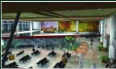
SKY HARBOR HVAC RETROFIT Johnson Controls