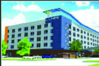
ALOFT HOTEL CB & E