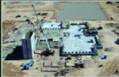
GOODYEAR SPRING TRAINING DEVELOPMENT COMPLEX BARTON MALOW