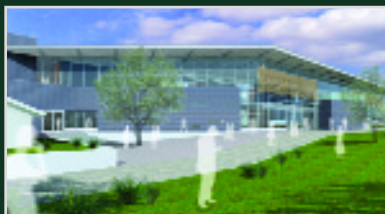
NAU DINING HALL EXPANSION KINNEY CONSTRUCTION