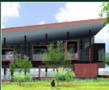
PVCC LIFE SCIENCE BUILDING BARTON MALOW COMPANY