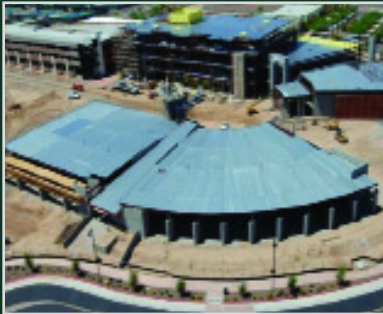
SURPRISE CITY HALL D.L. WITHERS CONSTRUCTION